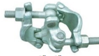
2" x 2" Right Angle Clamp