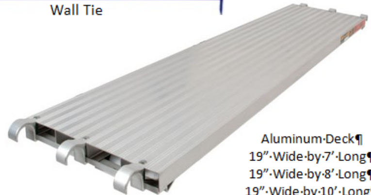
Aluminum Deck 19" Wide-by-7' Long 19" Wide-by-8' Long 19" Wide-by-10' Long