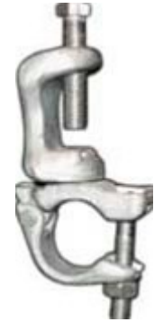
Pipe to Header Clamp