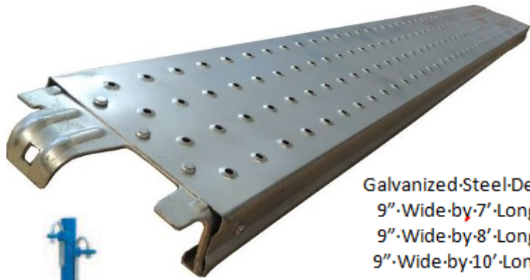
Galvanized Steel Deck 9" Wide-by-7' Long 9" Wide-by-8' Long 9" Wide-by-10' Long