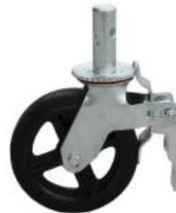
8" Locking Caster